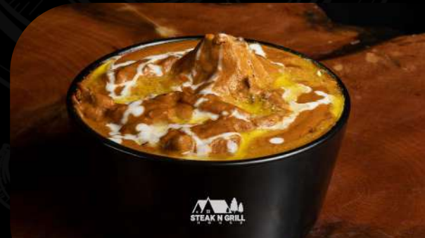
BUTTER CHICKEN MASALA