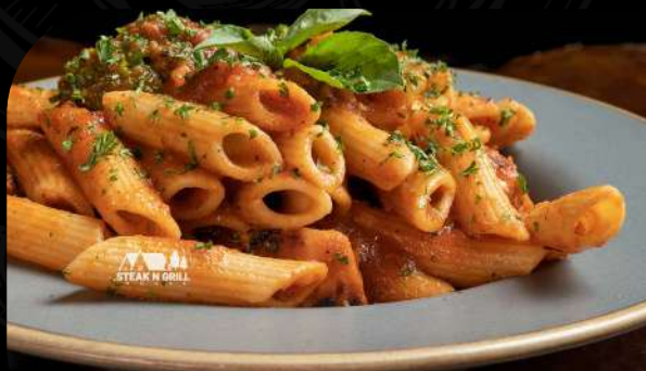
MONTECARLO PENNE PASTA