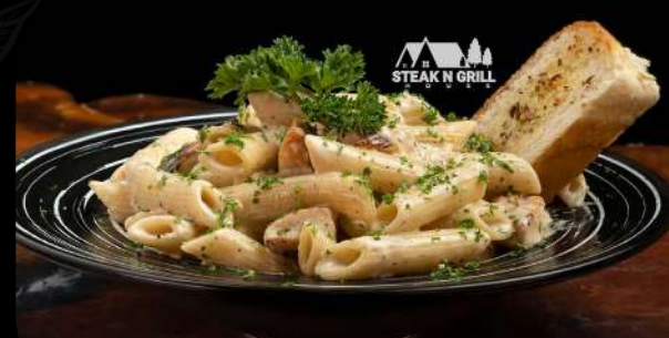
ALFREDO PASTA (VEGETERIAN)

Food Preparation time will be 20 to 30 minutes* Orders once placed cannot be cancelled* This menu issued on 5th May 2024 Prices are subjected to change without notice